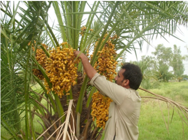
Harvesting of Hillawi dates at Rutab stage