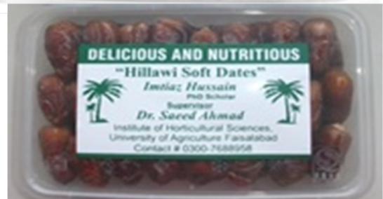
Soft semi-dried dates packed in small trays and boxes