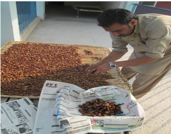
Removal during evening in basket