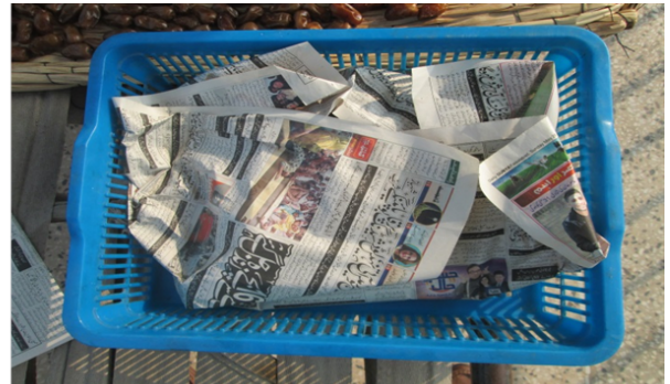
Dates covered with newspaper